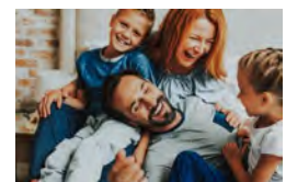
Making Family Life fun