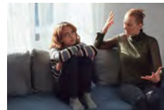
The Best Way to Say No! To Your Kids