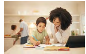
Family Goal Setting