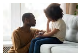
Teaching Children that Mistakes are Okay