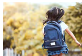
Every Day Counts